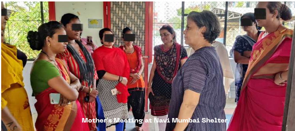
Mother's Meeting at Navi Mumbai Shelter