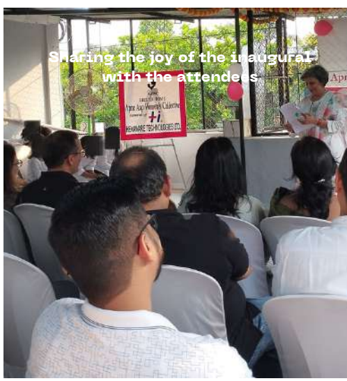
Sharing the joy of the inaugural with the attendees