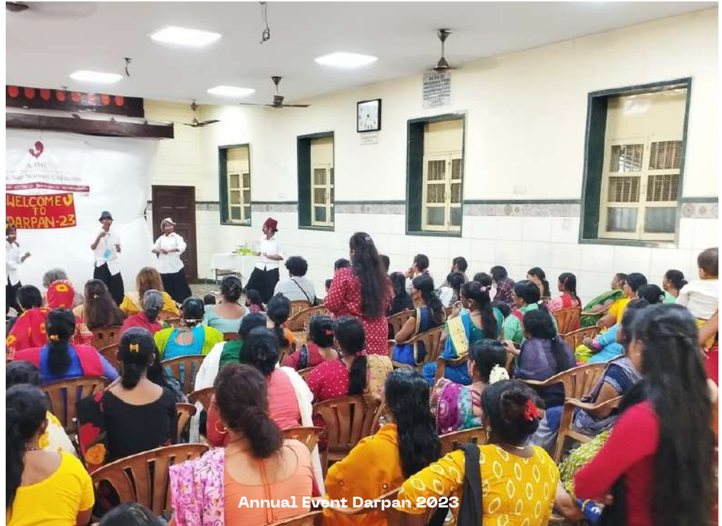
Annual Event Darpan 2023