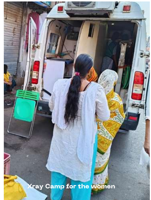
Xray Camp for the women