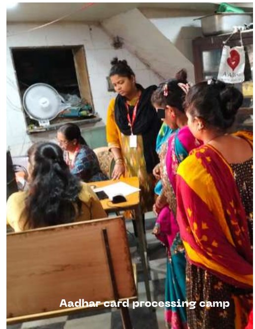
Aadhar card processing camp