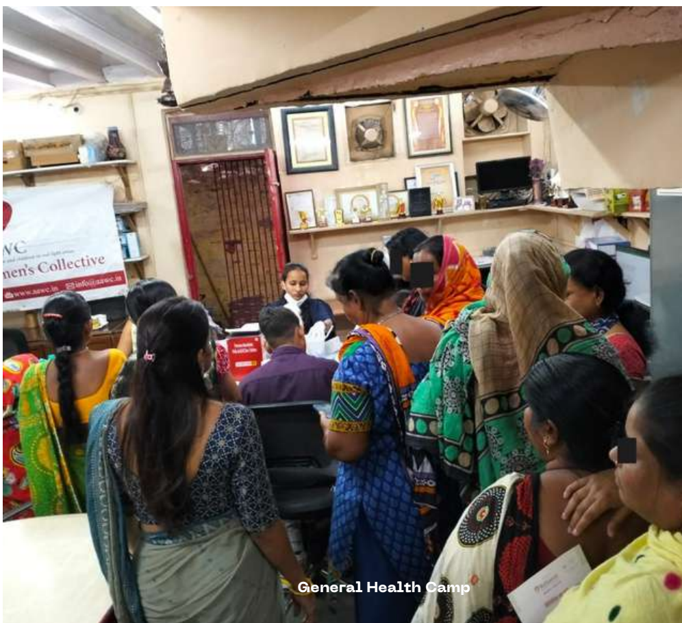
General Health Camp