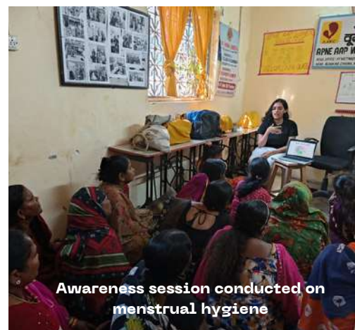
Awareness session conducted on menstrual hygiene