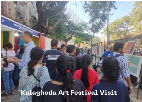
Kalaghoda Art Festival Visit