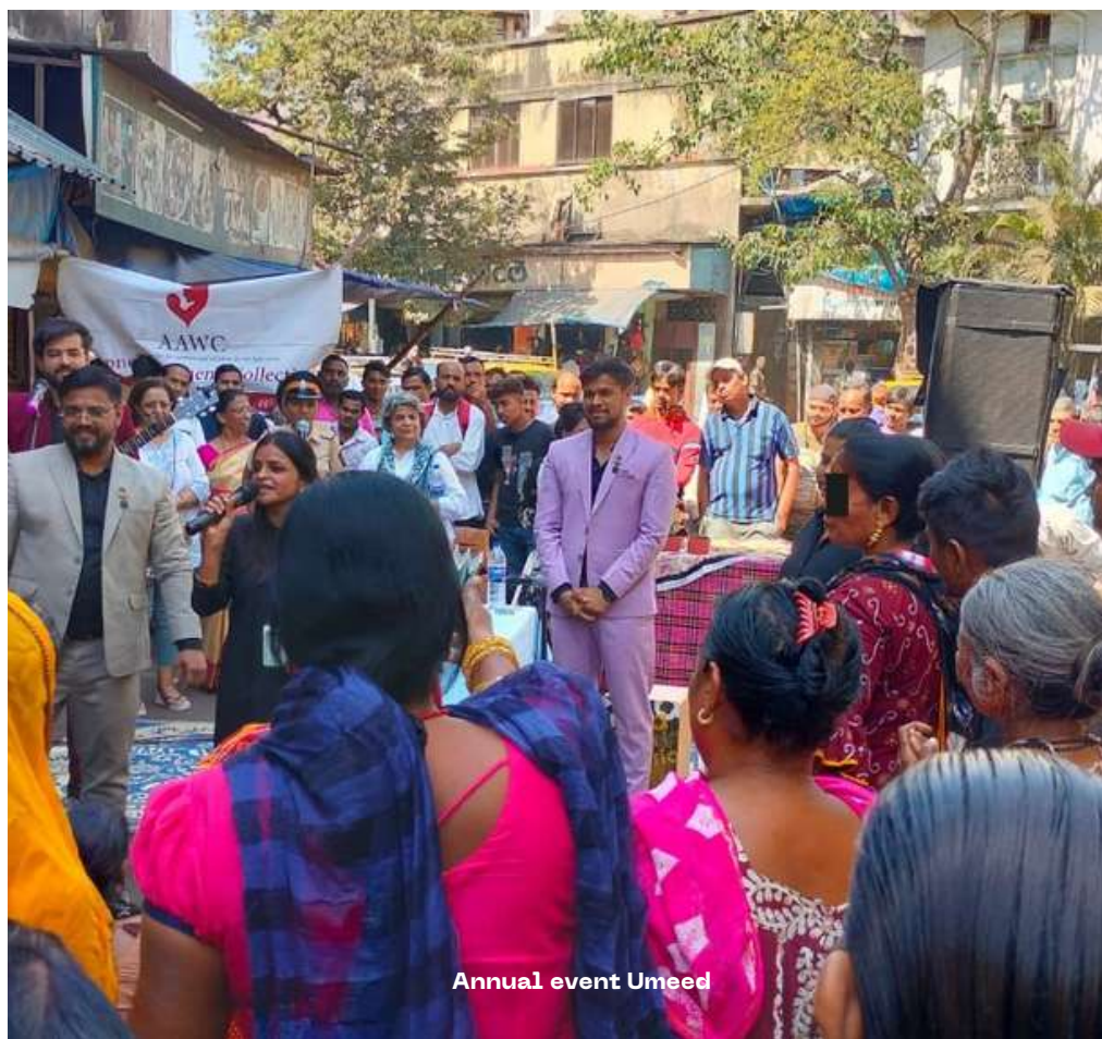
Annual event Umeed