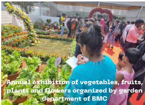
Annual exhibition of vegetables, fruits, plants and flowers organized by garden department of BMC