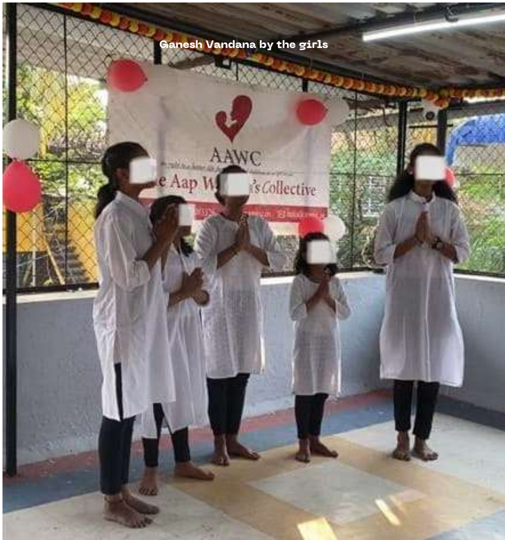
Ganesh Vandana by the girls