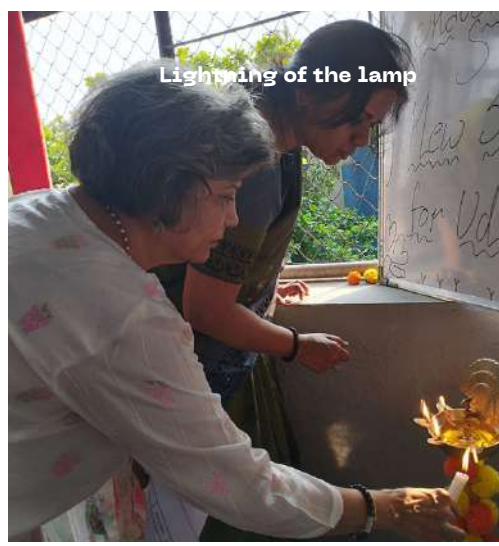
Lighting of the lamp

To provide a conducive environment of living and development for the daughter's of the women in the brothel based prostitution a new shelter has been initiated away from the red light area in Navi Mumbai , Maharashtra. The shelter will house 25 girls and provide them with all the ammenities and services for an overall holistic development to lead them towards a dignified life.