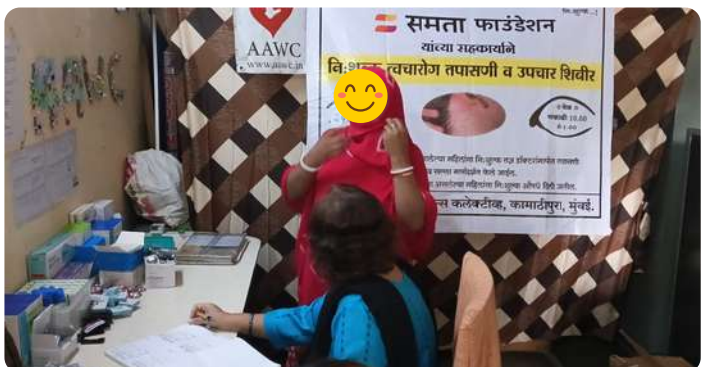
General Medical Camp