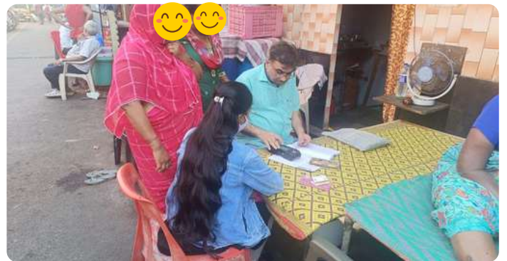
Ration Card KYC Camp