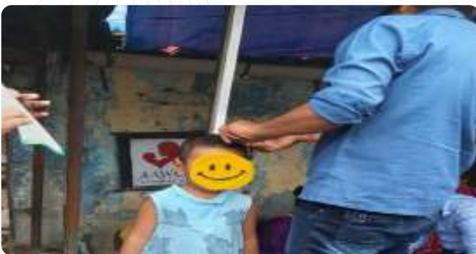
Height and Weight Measurement