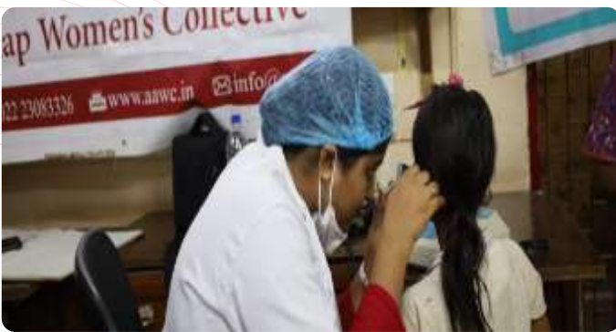
Medical Check Up