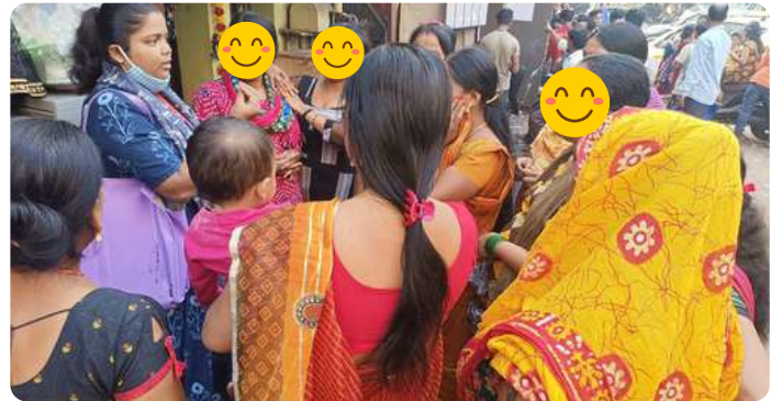
Outreach and Community Engagement