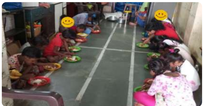
Nutritious Lunch at the Centre