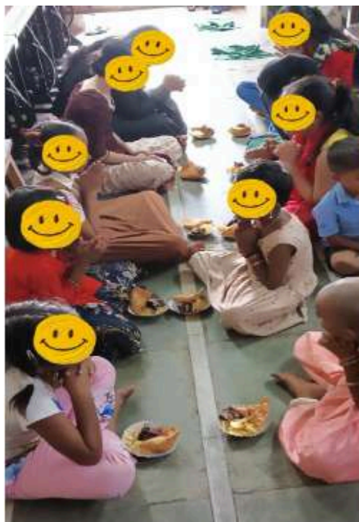
Evening Snacks Welcome Vacation