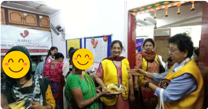
Makar Sankranti Celebration with Lions Club