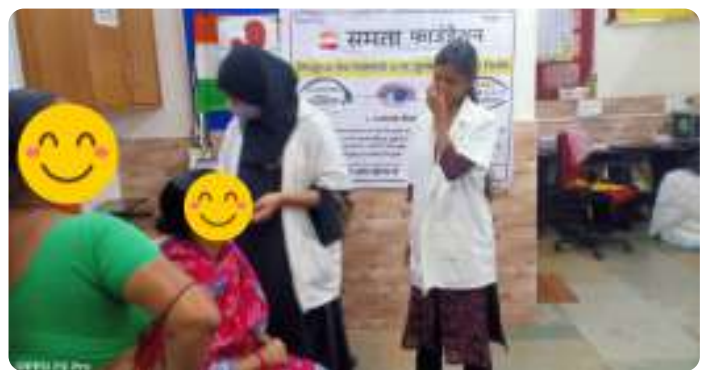
Eye Check-up Camp