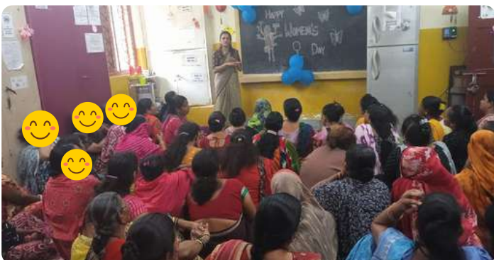
Women's Day Celebration