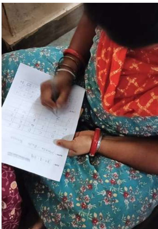
Assessment under Adult Literacy Program