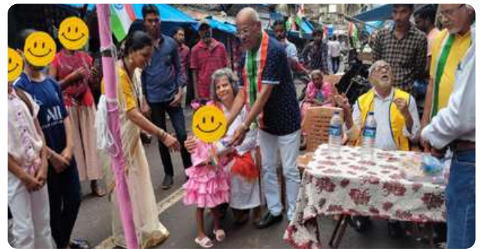
Republic Day Celebration