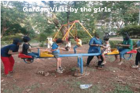
Garden Visit by the girls