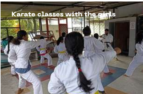
Karate classes with the girls