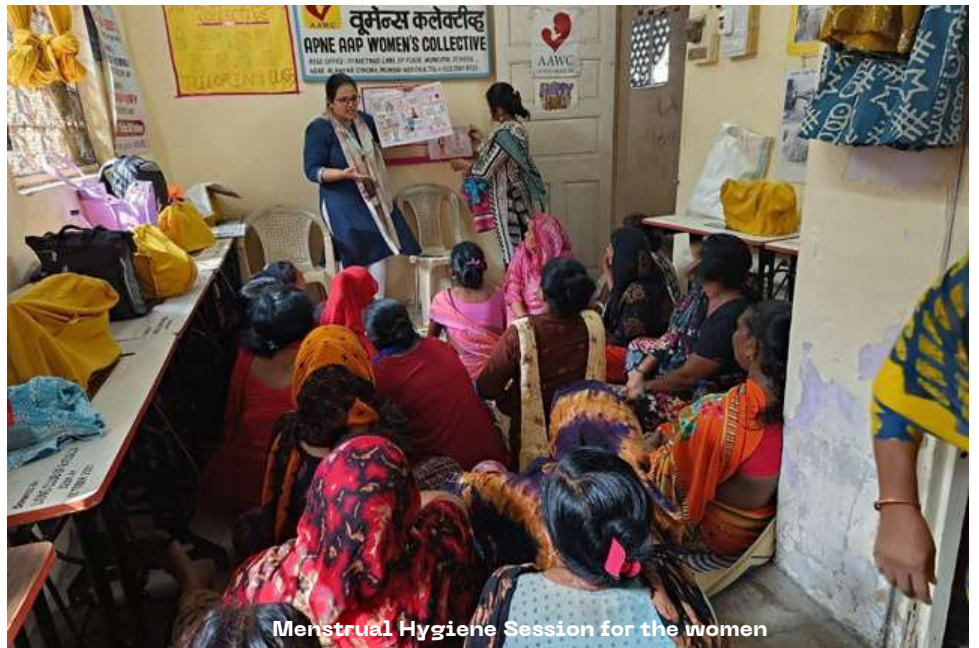
Menstrual Hygiene Session for the women