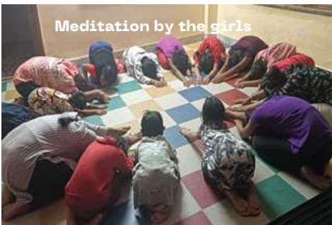
Meditation by the girls