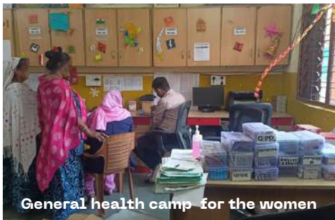
General health camp for the women