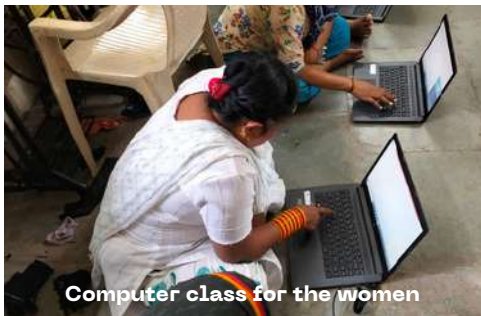
Computer class for the women