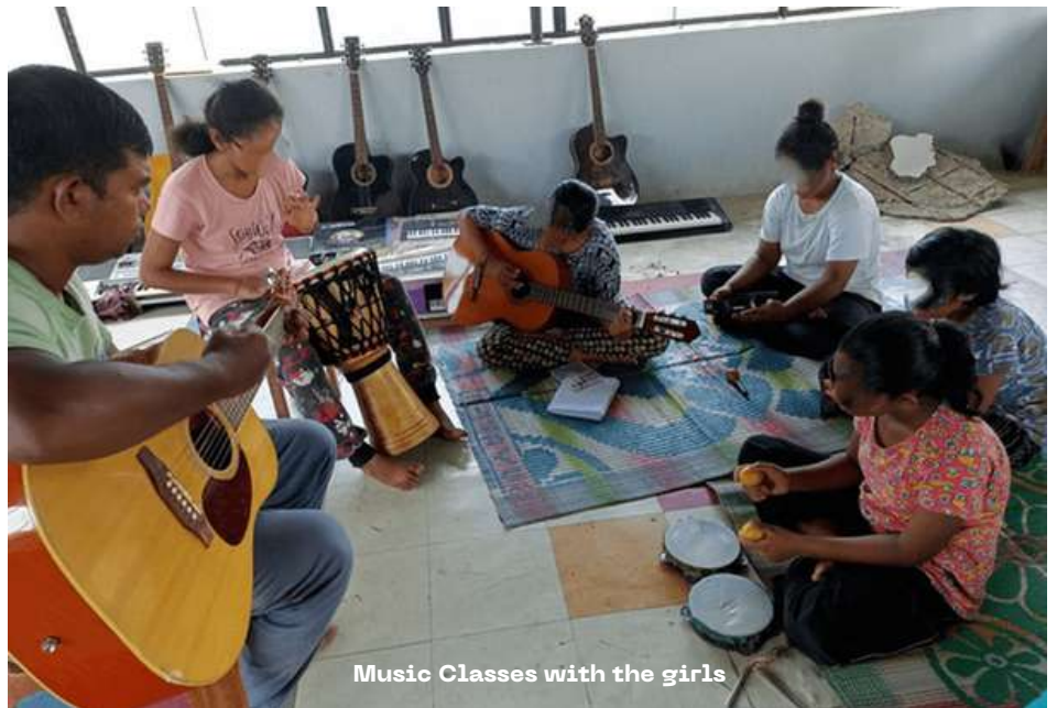
Music Classes with the girls