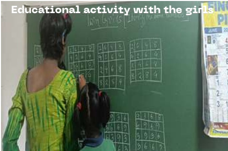
Educational activity with the girls