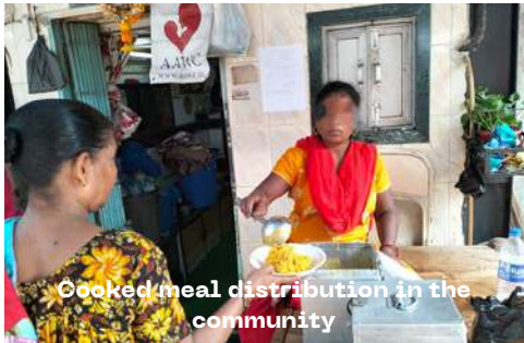
Cooked meal distribution in the community