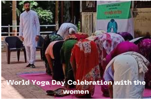
World Yoga Day Celebration with the women