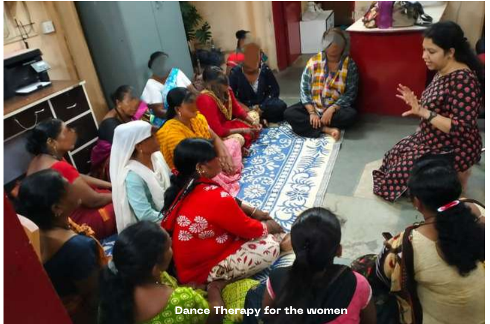
Dance Therapy for the women