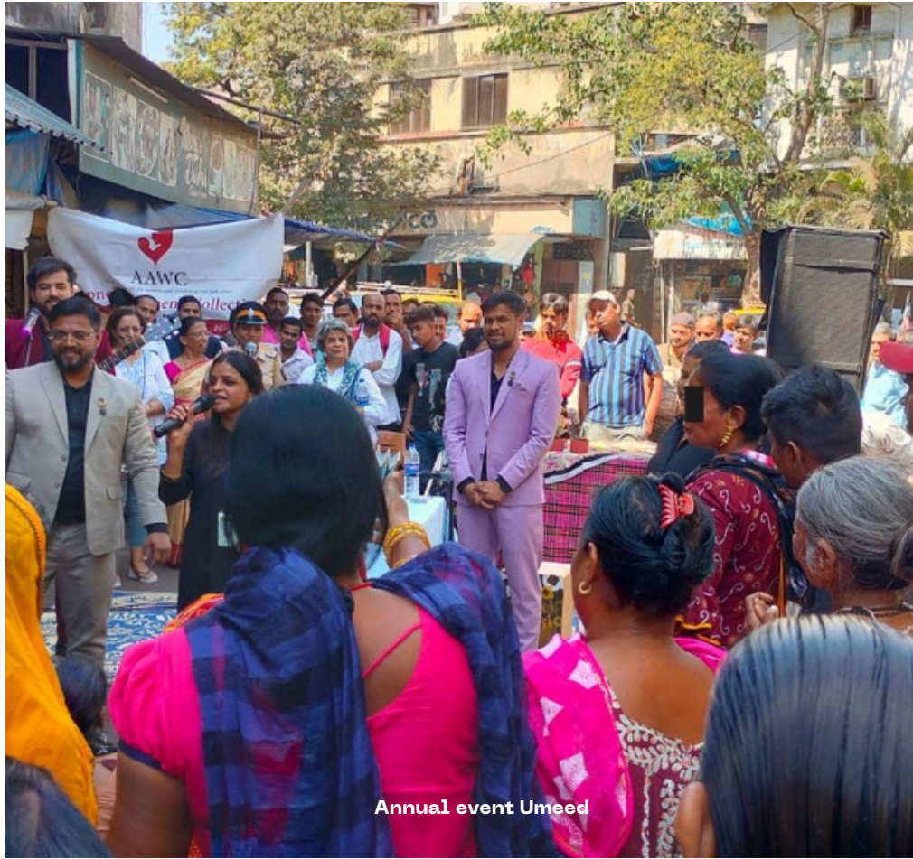
Annual event Umeed