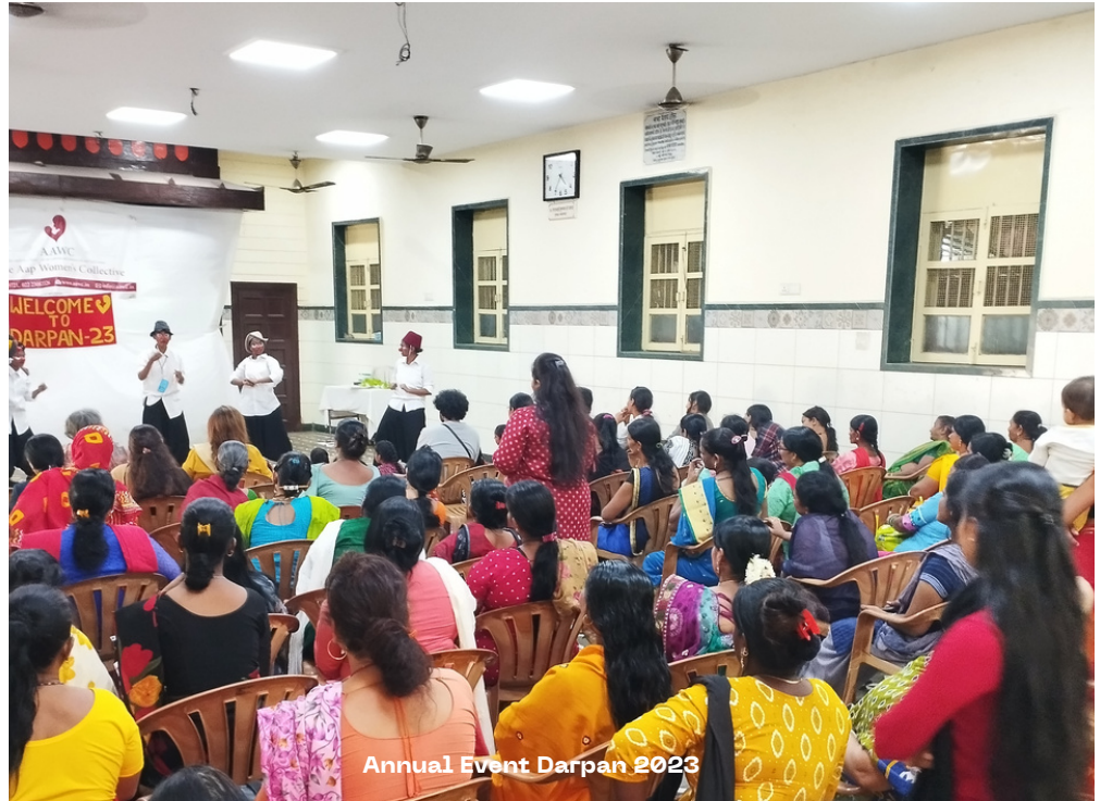
Annual Event Darpan 2023