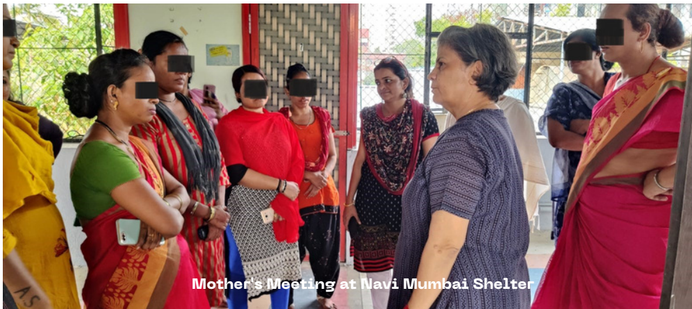
Mother's Meeting at Navi Mumbai Shelter