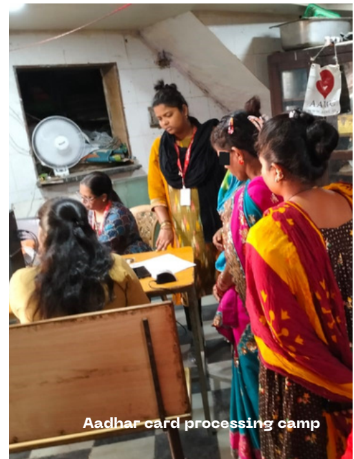
Aadhar card processing camp