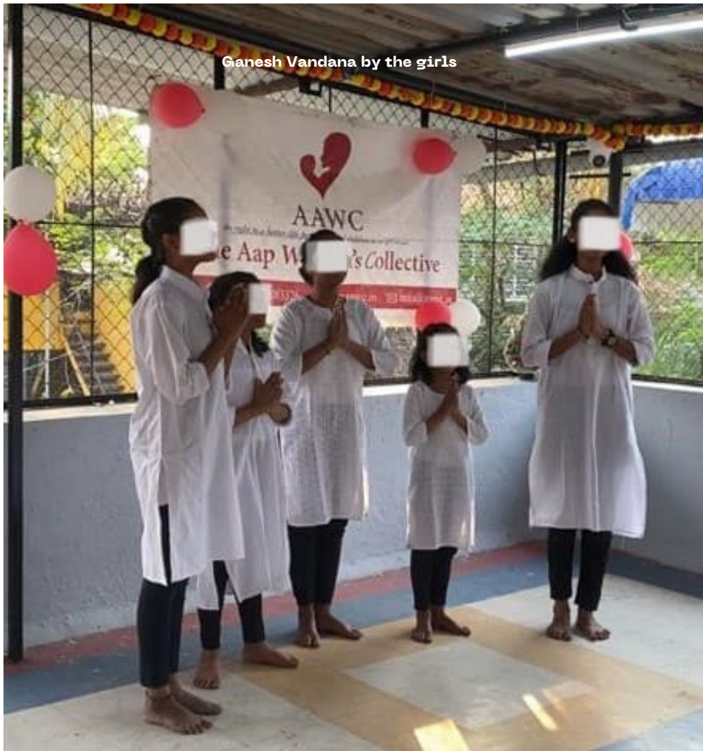
Ganesh Vandana by the girls