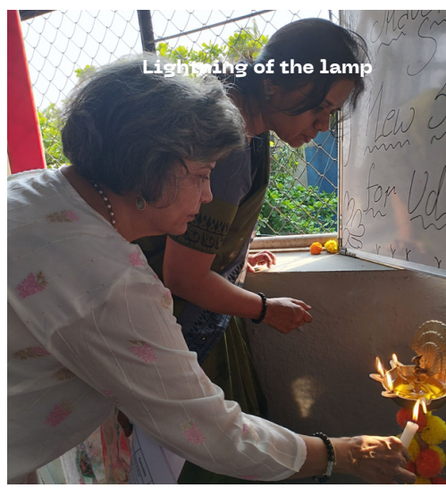
Lighting of the lamp

To provide a conducive environment of living and development for the daughter's of the women in the brothel based prostitution a new shelter has been initiated away from the red light area in Navi Mumbai , Maharashtra. The shelter will house 25 girls and provide them with all the ammenities and services for an overall holistic development to lead them towards a dignified life.