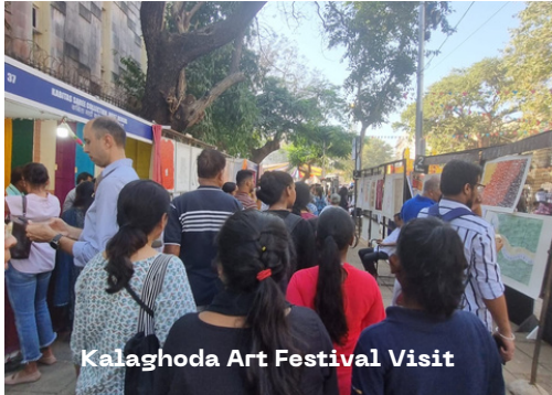
Kalaghoda Art Festival Visit