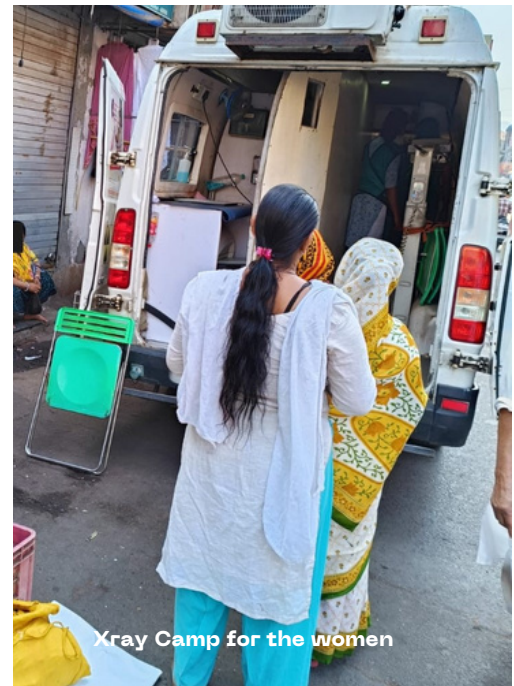
Xray Camp for the women