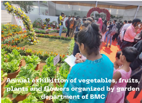
Annual exhibition of vegetables, fruits, plants and flowers organized by garden department of BMC