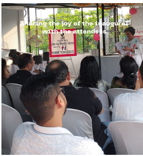
Sharing the joy of the inaugural with the attendees