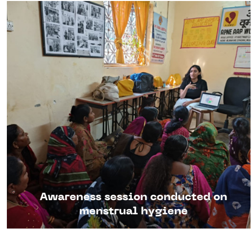
Awareness session conducted on menstrual hygiene